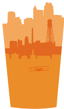
north carolina cityscapes