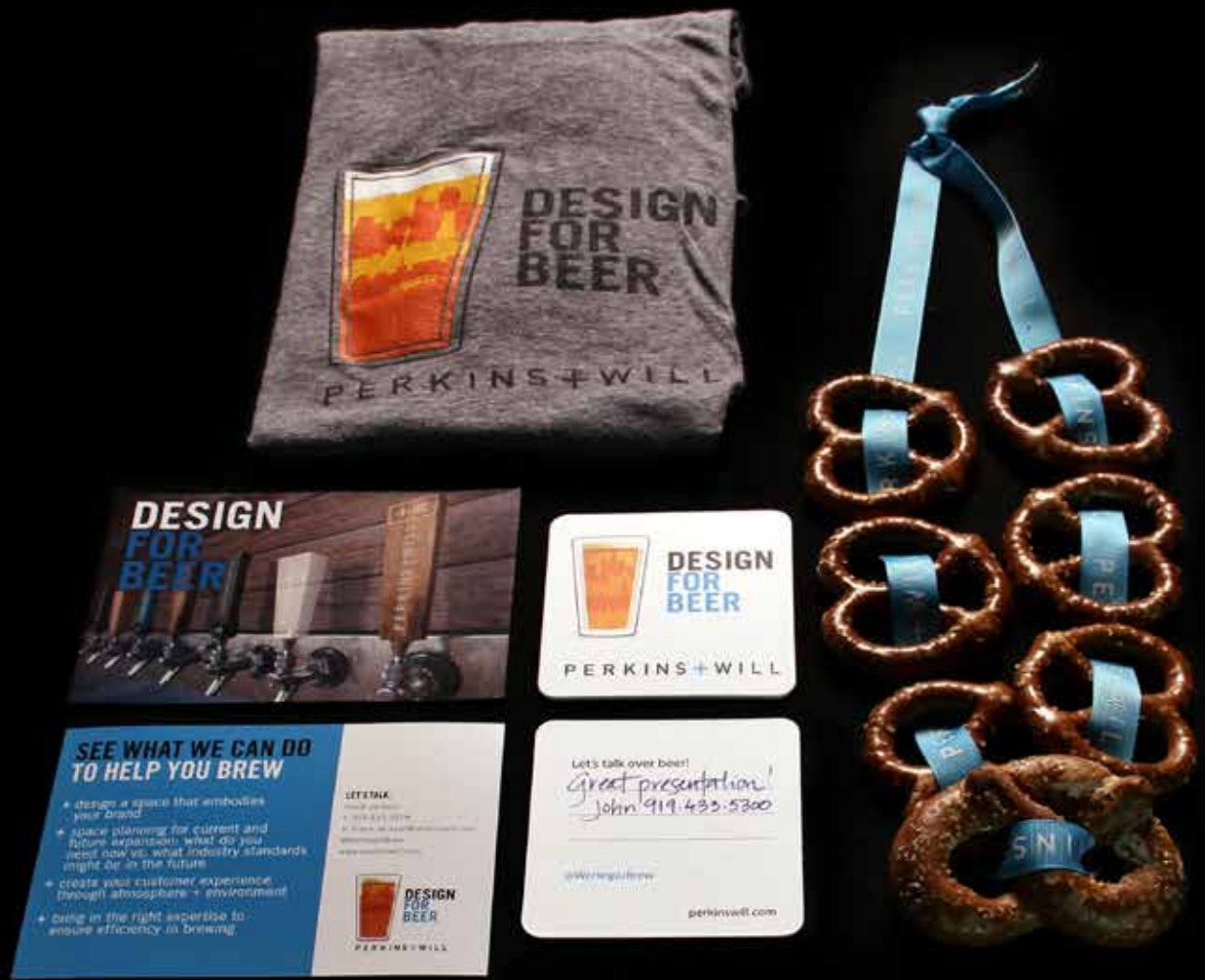
brewery campaign package